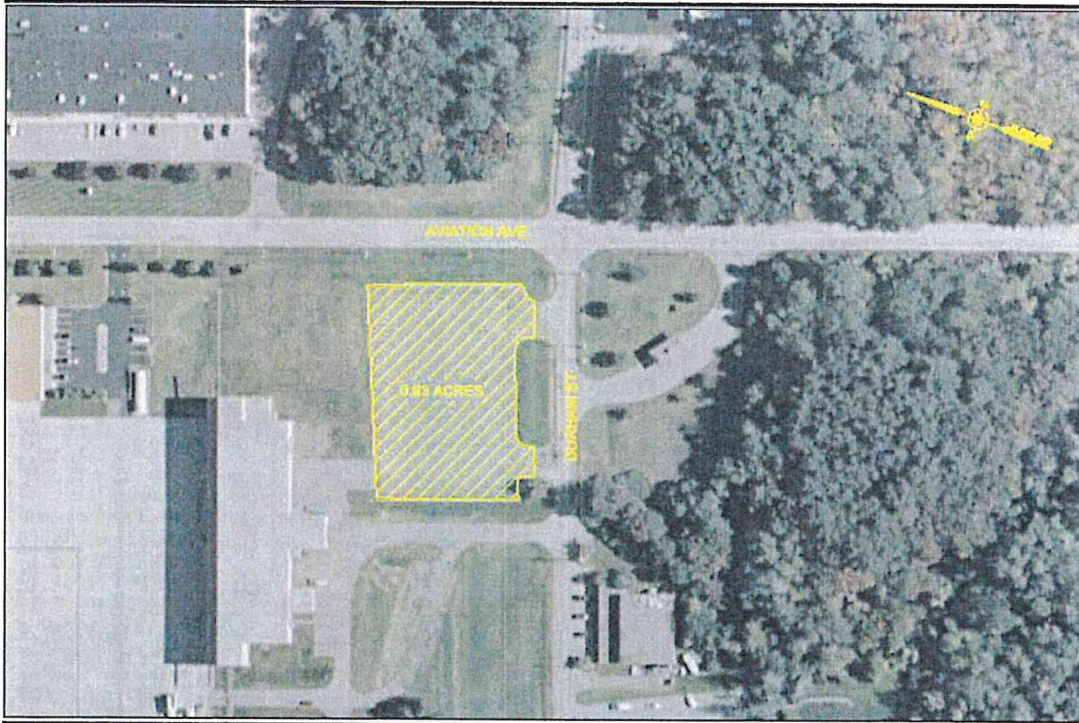
EXHIBIT A PREMISES

C&J Trailways Satellite Parking at 42 Durham Street